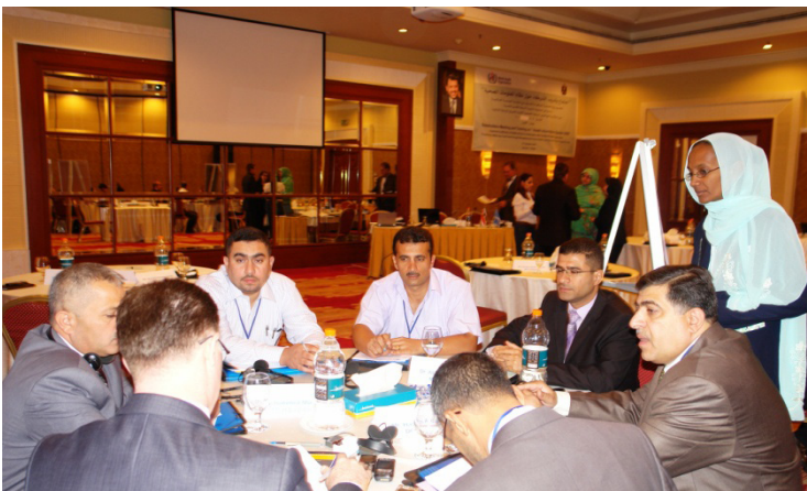
Iraqi stakeholders review the findings of the Health Information System assessment in March 2011 in Baghdad.