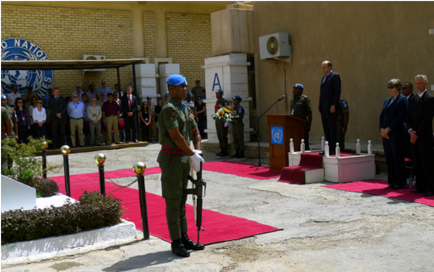
SRSO Ad Melkert and UNAMI staff commemorate the 8th anniversary of the attack on UN Headquarters in Baghdad, 19 August 2011.

rum, a network of Iraqi civil society organizations. "This is to send a message to the world that Iraqis will not forget those who stood by us, extending a helping hand. It is also a message (...) that Iraq is home to peace, love and accord. Acts of terrorism have nothing to do with Iraq's history, genuineness and generosity," the Forum said in a delivered statement.