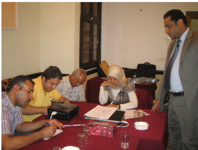
Iraqi journalists work on a court reporting exercise in June 2011.

By Shabaz Jamal and Birgitte Bellsund, UNDP -Iraq