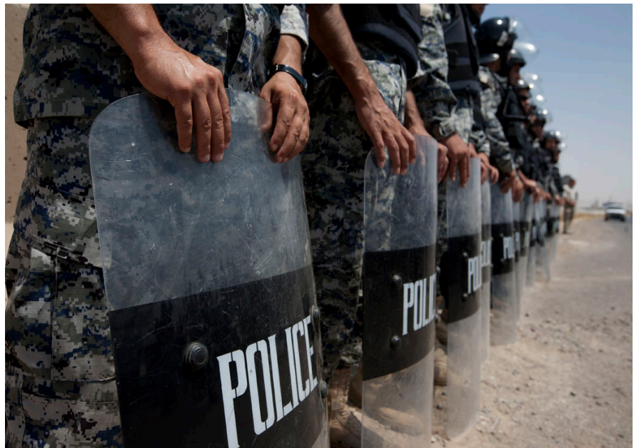
Police stand ready for a demonstration in June 2011 in Erbil, located in Iraq's Kurdistan region.

“ This is what the UN represents. In the idea and in the act. A courageous report in Lebanon; a groundbreaking referendum in Sudan; an essential transfer of power in Côte d'Ivoire; indispensable support to reconstruction after disaster in Haiti; ongoing engagement after decades of wars and devastation with the people of Iraq,