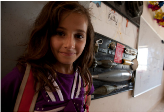
Ashawa, Dohuk Governorate, Kurdistan region of Iraq -- A student from Ashawa Primary School, one of the beneficiaries of the UNICEF-supported Mine Risk Education Summer programme in Ashawa village. The initiative is implemented by the General Directorate of Mine Action and the Iraqi Kurdistan Mine Action Agency and funded by UNICEF. The programme runs through the long summer holiday, offering children a nice alternative in education.

The Baby Friendly Hospital Initiative was launched by World Health Organization and UNICEF in 1991 to implement practices that protect, promote and support breast-feeding. There are 32 hospitals enrolled in the initiative across Iraq. UNICEF has been operational in the country since 1983.