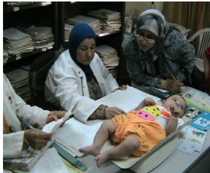
Staff at the Ministry of Health monitor the growth of an Iraqi child in Baghdad.

The Iraqi Ministry of Health has requested UN agencies (WHO and UNICEF) support and help develop a comprehensive national nutritional strategy and plan of action for 10 years (2012-2021). The plan is to cover various nutrition related areas such as policies, maternal nutrition strategies, obesity control, school meals, people with special needs, food security and safety and micronutrient deficiencies.