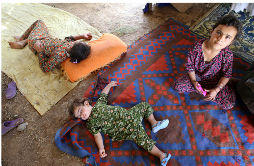
Displaced Iraqi children in Gojar, a village located along the Iraq-Iran border.