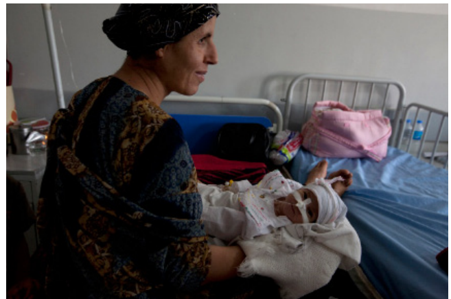
Ahmedi, Dohuk Governorate, Kurdistan region of Iraq -- A mother and her baby in Ahmedi hospital where UNICEF is implementing the Baby Friendly Hospital Initiative (BFHI) and training the staff. UNICEF's work across Iraq aims to support the Government to develop child-friendly policies, build the capacity of institutions that deliver essential services to children, and convene all duty bearers to realize the full rights of Iraqi children.

The UN refugee agency (UNHCR) provides cash assistance to refugee families once a year based on a needs assessment basis. In Erbil, these funds are distributed through UNHCR's Protection Assistance Center, which is managed in coordination with Public Aid Organization, the agency's implementing partner in the region. In 2011, 133 refugee families benefited from this programme.