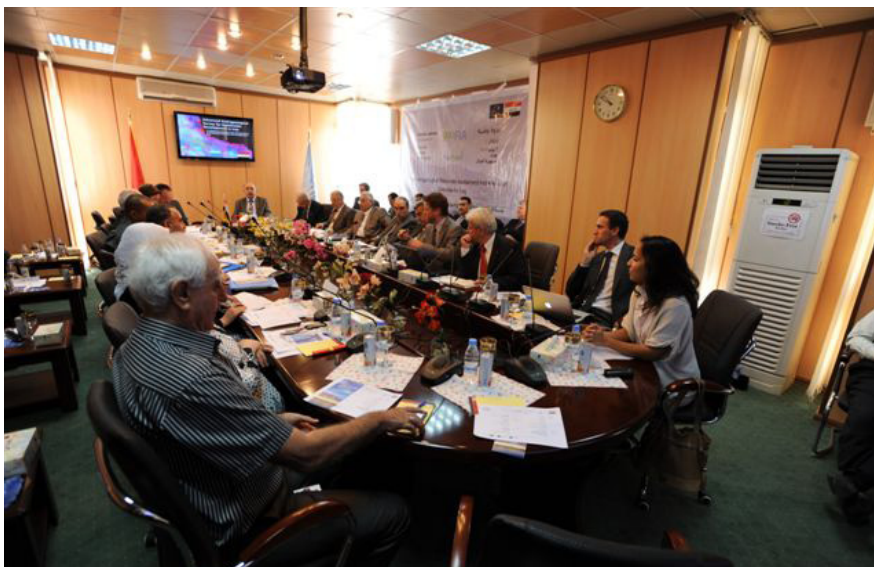
Representatives of the Government, academia and the international community at the launch of Iraq's first groundwater database on 3 July 2011.