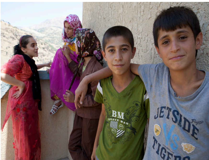
Young Iraqi students in the village of Halshoo, located in the Suleimania Governorate of Iraq's Kurdistan region, enjoy a break during a mine risk education session, a summer programme implemented by the General Directorate of Mine Action and funded by UNICEF.