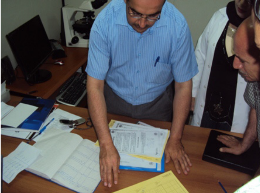
World Health Organization staff examine tuberculosis cards during their June visit to Azadi hospital in Duhuk, located in Iraq's Kurdistan region.

Estimating the burden of tuberculosis (TB) in Iraq was the focus of a World Health Organization (WHO) - Iraq workshop held in Erbil, in Iraq's Kurdistan region, from 29 May to 2 June 2011.