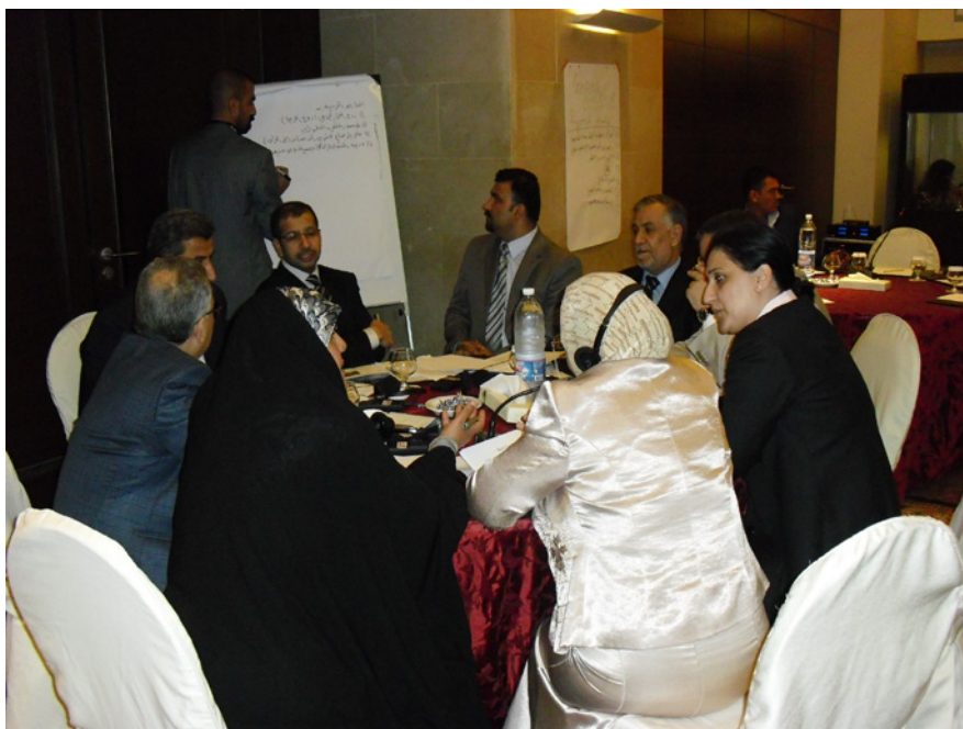
Participants discuss the selection criteria for commissioners during a workshop held on 1-6 July 2011, in Beirut, Lebanon.

A national, independent human rights body serves as a fundamental institution for advancing open, democratic governance by undertaking the promotion and protection of human rights as required by the State's international human rights obligations. The Government of Iraq is in the process of establishing such an independent institution, to be known as the Independent High Commission for Human Rights (IHCHR).