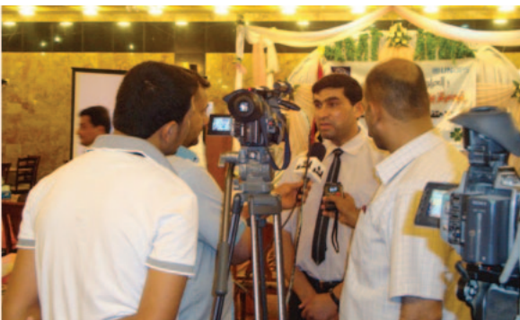
A medical consultant at Bahjat Al Fouad Rehabilitation Centre for Torture Victims speaks to local media during an advocacy event to mark the International Day in support of torture victims.