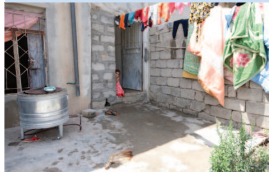
With schools opening in the fall, registering the children will be a challenge as many displaced families lack the necessary civil documentation, such as identity cards.