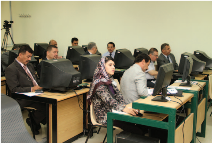
Participants in the Avicenna Virtual Campus Technical workshop, held in Philadelphia University in Jordan on 21-22 June 2011.

Hosted by Philadelphia University, a leading UNESCO e-learning Center in the Middle East, the meeting focused on enhancing the quality of education through the improvement of online course production and virtual teaching processes while building consolidated partnerships among Iraqi and international universities.