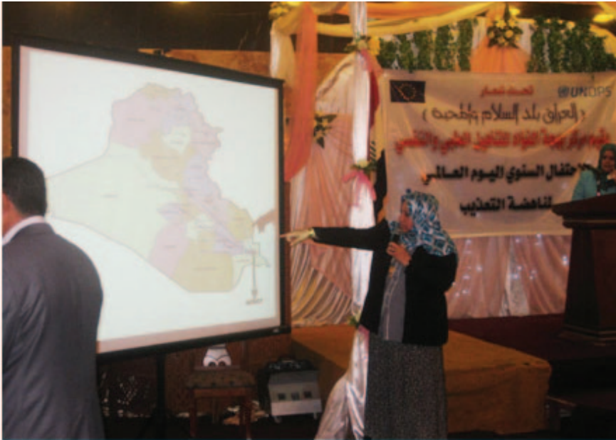
A staff member presents the work of the outreach team which provides services to victims of torture in nearby provinces.