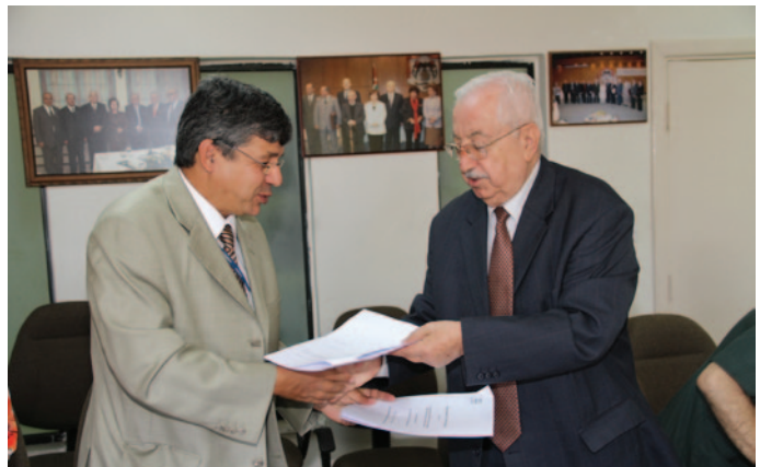
Director of UNESCO Iraq signs a memorandum of understanding with the head of Philadelphia University in Jordan.

The event held in Jordan from 21 to 22 June, 2011, brought together four e-learning international experts from France, Turkey and Germany and a team of 18 Iraqis from nine universities, to build a vision for a university of the future in Iraq.