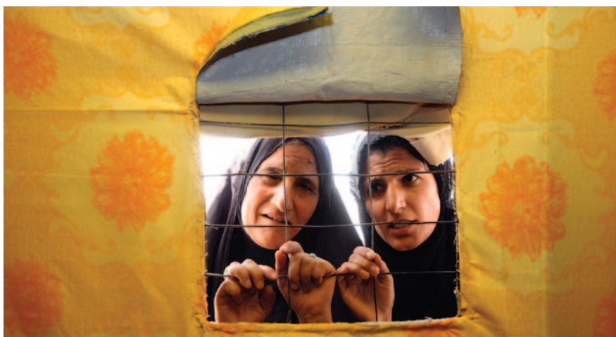
Palestinian refugee women look through a hole in a tent in Al Waleed camp. The camp, located along Iraq's border with Syria, now hosts 540 Palestinians. UNHCR relocated some 1,200 Palestinian refugees from Al Waleed camp to various resettlement countries. Of the estimated 34,000 Palestinians in Iraq in 2003, less than 10,000 remain in the country at present. The camp also hosts 173 Iranian Kurds and 101 Iranian Ahwazis.

W orld Refugee Day was celebrated on 20 June to pay tribute to the millions of refugees and displaced people throughout the world who have been forced to flee their homes because of