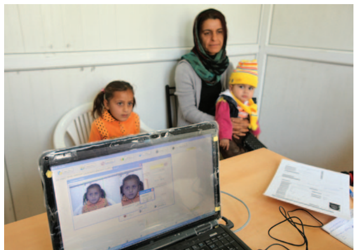
A Turkish refugee woman and her children take part in the new registration in Makhmour camp. The camp hosts 10,240 Turkish refugees. Most arrived in Iraq in 1994 following armed conflict in southeast Turkey. The Government of Iraq, assisted by UNHCR, started a new registration of all refugees in the camp on 31 October 2010, which was completed on 19 June 2011.