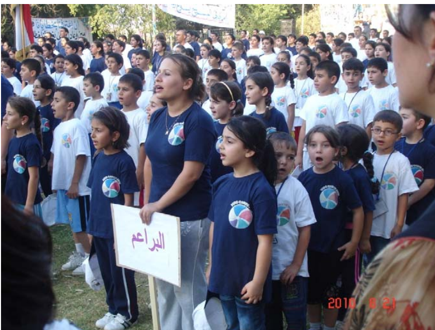
Kirkuk youth singing for peace at the championship event.