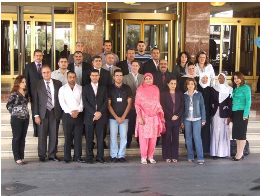
WHO/EMRO along with other participants during the Regional Workshop on Framework for Decentralization of Health Services in Amman-Jordan.

Iraq's first National Health Accounts (NHA) survey was successfully completed in September 2010. The Iraqi Health Ministry assisted by the World Health Organization (WHO), is in the process of entering data prior to proceeding with data analyses based on