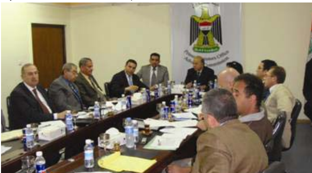
Working Group for Tax Policy's joint meeting with UN PSDP-I, OECD and USAID, Baghdad, 15 April 2010.