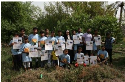
Marshlands' photo: Children and youth joining the Literacy Campaign in the Marshlands.

On the occasion of International Literacy Day, celebrated globally on 8 September, UNESCO called on national institutions and civil society to join forces to promote literacy for all as a tool for inclusive and sustainable development in Iraq.