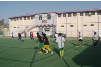
A football team in Baghdad.