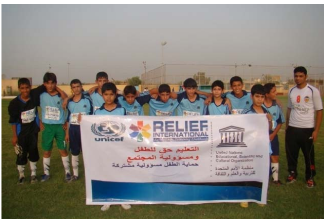
Children and youth joining the Literacy Campaign in the Marshlands, Karbala.

Two decades of war, sanctions and deprivation impacted on the quality and availability of education which has deteriorated dramatically since 1990. It has resulted in the emergence of a high level of illiteracy in the country which impacts in every aspect of life such as employment, health, civic participation and social attitudes.