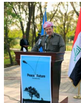
President Mas'ud Barzani gives a speech for International Peace Day in Erbil. Sept 21, 2010.