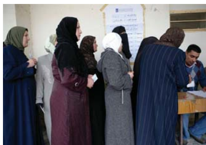
Women voters register at a voting centre in Baghdad.