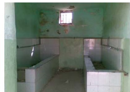
Al-Khawarnaq school's toilets before rehabilitation work.

Similarly, attending Al-Fasaha primary school in the same district, ten year old friends Halima Abdullah and Su'ad Salih also avoid using the school's toilets fearing that the old and dilapidated roof might collapse over their heads. Along with other pupils, Halima and Su'ad also suffer from a lack of drinking water, blocked sanitation facilities and the pungent odour of open sewage plaguing the school.