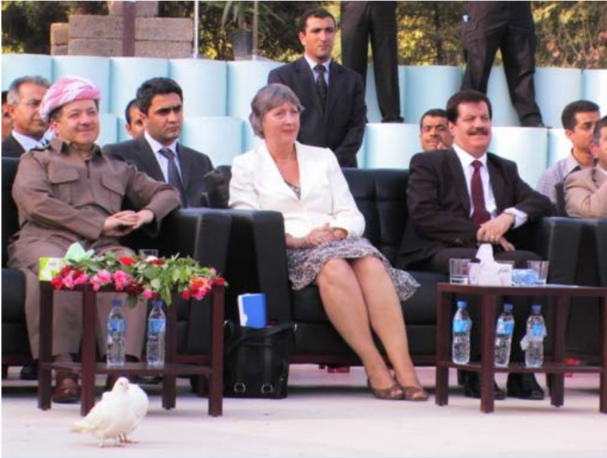
DSRSG McNab and President Mas'ud Barzani at the International Peace Day celebration in Erbil. September 21, 2010.

McNab while further emphasising the importance of "building a future where common ground is sought and common good is put before individual differences".