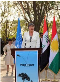
DSRSG McNab delivers a speech at the International Peace Day celebration in Erbil. Sept 21, 2010.