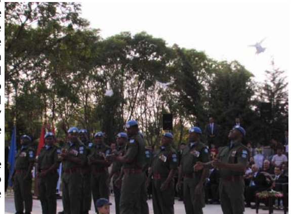
Release of white doves at the celebration of the International Peace Day in Erbil. Sept 21, 2010.

Hosting this event for the first time in Iraq, UNAMI DSRSG McNab stressed the need to foster "peace that brings development, prosperity and wellbeing". "Peace is the greatest gift we can give our children", added DSRSG