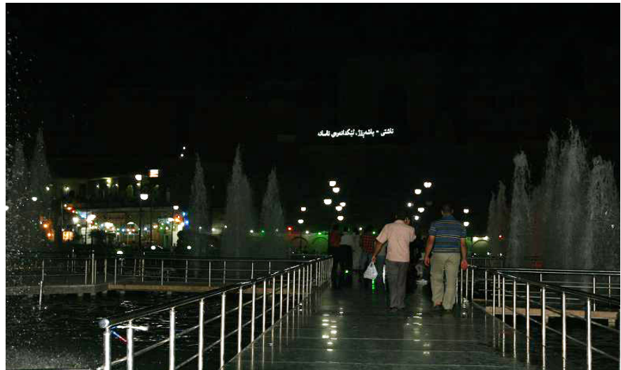
The Peace Day slogan put up at the Erbil Citadel.

As part of the world wide celebration of the International Day of Peace which falls on 21 September each year, UNAMI raised and illuminated on 19 September a fluorescent sign of the 2010 peace day slogan Peace=Future: The Math is Easy in Erbil, Kurdistan Region of Iraq.