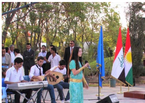
Celebration of the International Peace Day in Erbil. Sept 21, 2010.