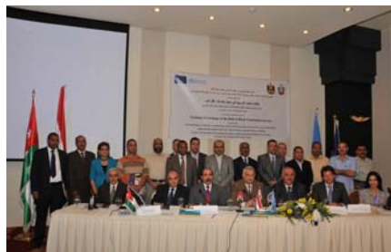
SMS Training workshop in Amman.

The Iraqi Ministry of Health, in collaboration with the World Health Organization (WHO) and the Jordan Directorate of Blood Bank, launched on 19 September a series of four training sessions benefiting 50 Iraqi health cadres working in the Iraq National Blood Transfusion Center and Regional Blood Banks. The four sessions of three weeks each aim to increase the technical and managerial skills of Iraqi professionals to ensure safety of blood and blood products and optimize blood usage for patient health.