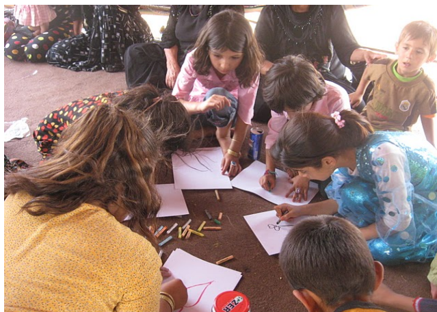
IDP children depict memories of burnt orchards, destroyed houses, and a safe haven that was their village.

"We wanted to give a chance to the IDP community to be heard, we wanted them to know that their views matter and their voices need to be heard, we wanted the children to feel like children and enjoy a day of fun" said