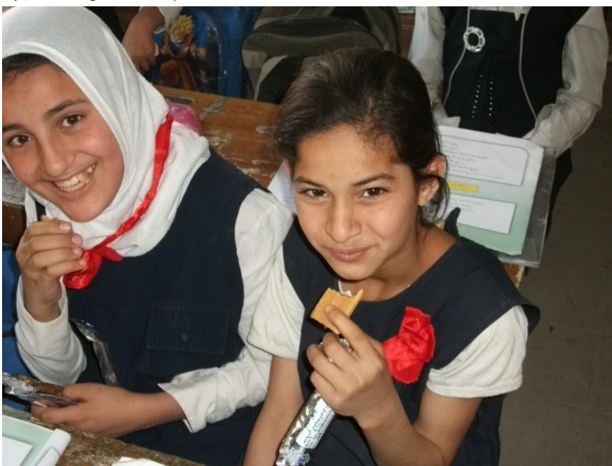
School girls in Baquba, Central Iraq enjoying their morning snack of date bars.

T he Government of Iraq and the World Food Programme (WFP) have partnered to develop a national school feeding programme, initiating implementation with a USD 17 million contribution from the Government of Iraq.