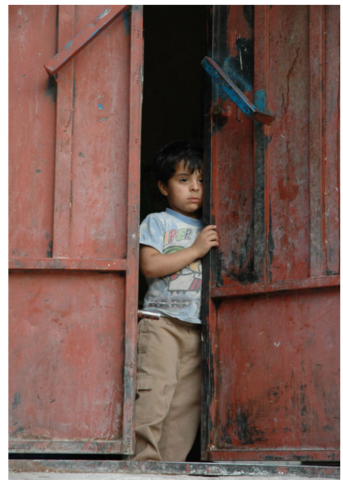
Sadness on the face of an Iraqi child.

In Iraq, the MRM CTF was established on 7 June 2010 and is being co-chaired by UNAMI and UNICEF. By March 2011, the MRM CTF Iraq will produce a public report on Iraq that will review incidents of the six grave violations that occurred between January 2008 and December 2010. ■